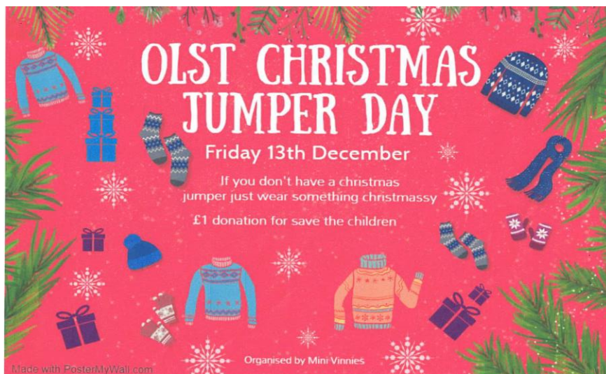
Poster designed by Lola Hanson Year 4

Coventry Transport Museum – Y4 Mass letter